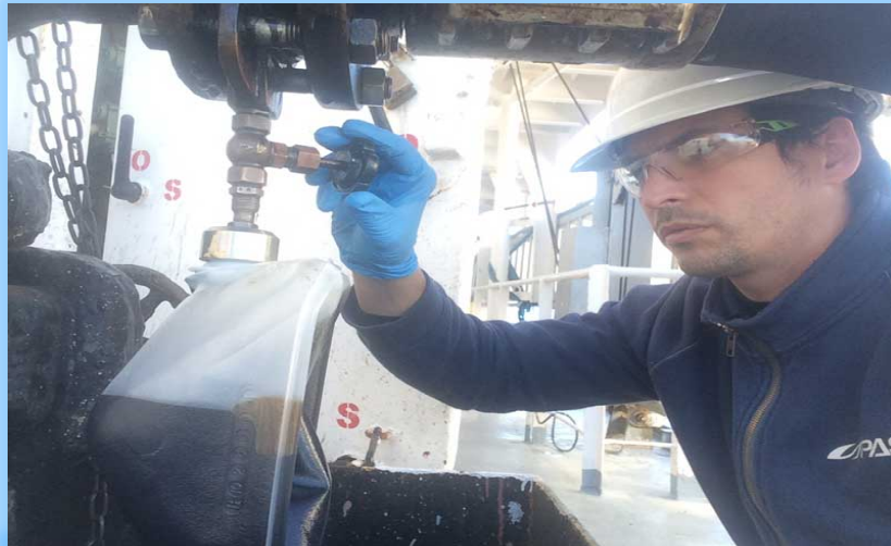
Surveyors at work